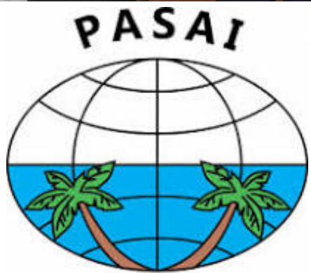
Pacific auditors working together